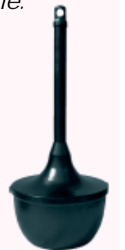
SRS-1 HCCL Hammered Charcoal