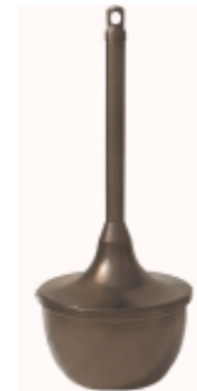
SRS-1 HCPR Hammered Copper