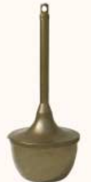
SRS-1 HGLD Hammered Gold